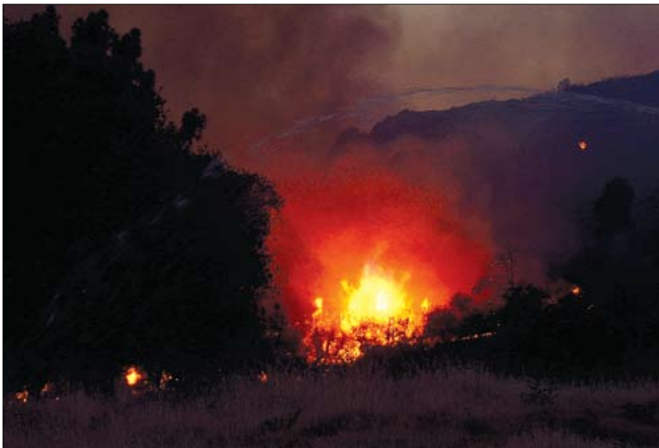
Humboldt Fire, June 2008—Twenty-foot flames in Butte Creek Canyon.